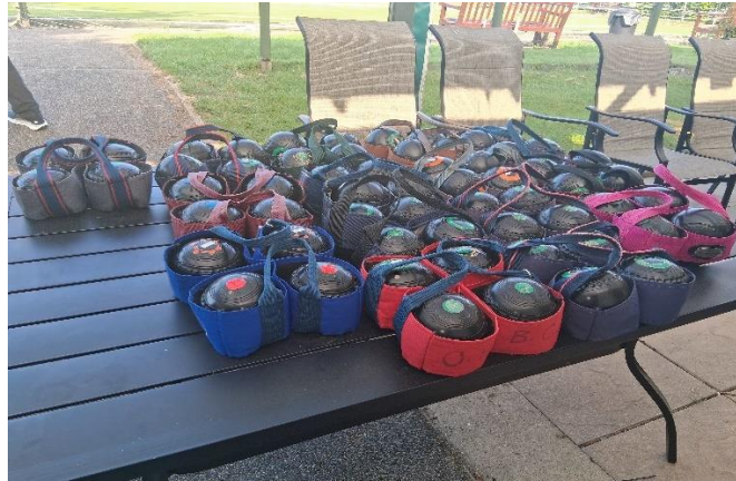
Bowls lined up for new members to try out